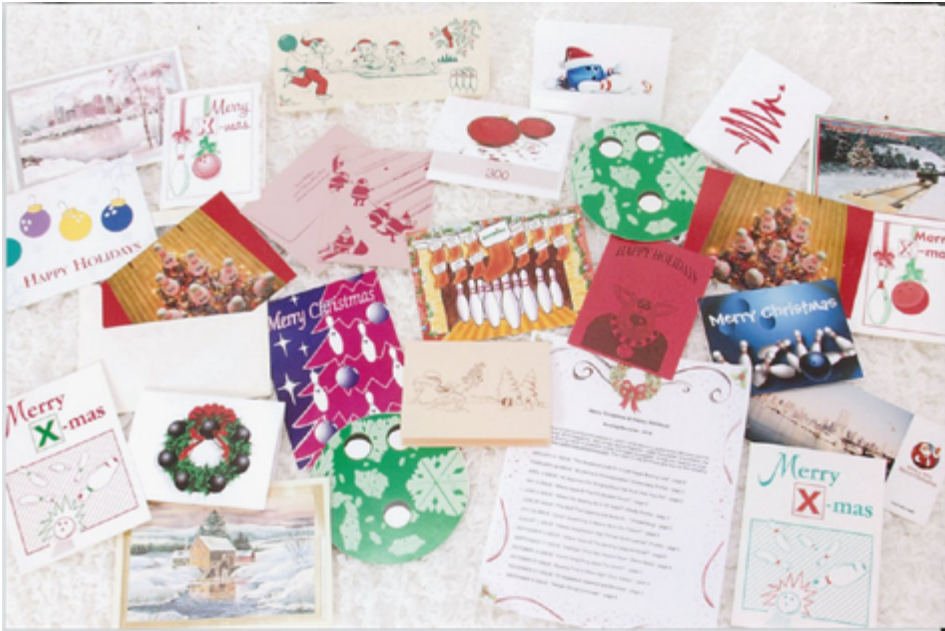
Cornucopia of Homemade Christmas Cards from 2020