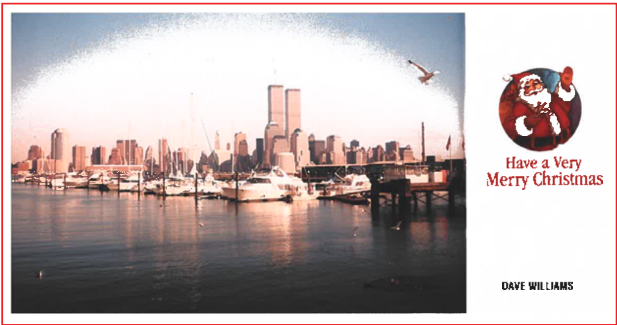
Christmas Card Greeting from 1998