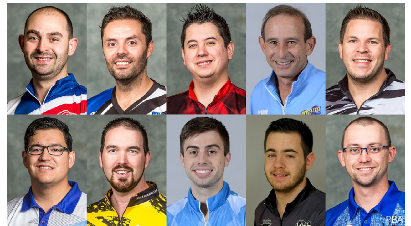
Who Is Your Pick For 2019 Player & Rookie of the Year2

sioner Tom Clark allowed the PBA Players Committee to make the decision as continued on page 5