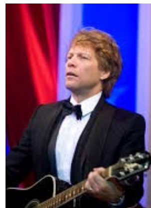
Jon Bon Jovi

"Unbroken" by Jon Bon Jovi is one of the title tracks on his newest album, "2020." Written for a documentary about veterans who are living with PTSD and the service animals who help them heal. It is a song about a young man who joins the military, goes to boot camp and then gets shipped out to the Middle East to fight in a war he knows nothing about.