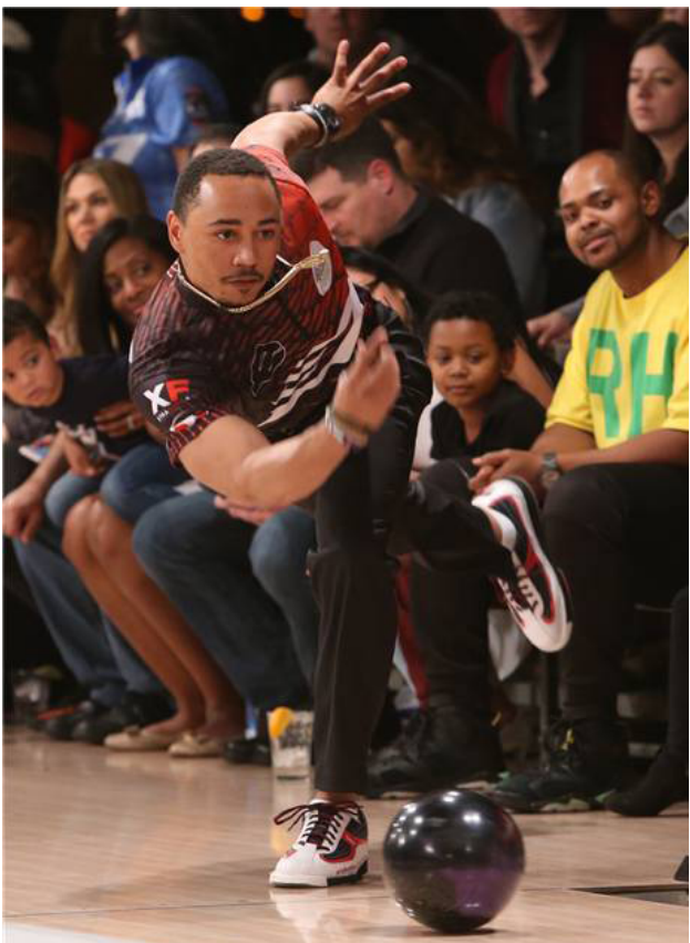
Mookie Betts - Professional Bowling Instructor?

Now it’s basketball that has taken on the concept of American exceptionalism. When I first heard Steve Kerr of the Golden State Warriors comparing the human rights abuses of China with a United States citizen’s 2nd amendment right to defend their family, I