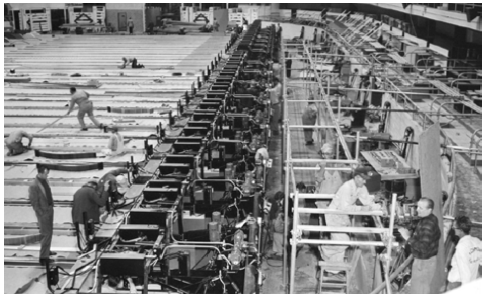
AMF lanes, machines (the automatics!) and under lane ball returns being installed at the 1957 USBC National Championships in Fort Worth, Texas

Another location that must have enjoyed the 10 cent per game lease program was Bowlero Torrance, that opened as Bowl-O-Drome in Torrance, Calif., in 1957, the year of the automatics introduction in Fort Worth. What an incredible time that must have been, with bowling centers popping up like gas stations. An article from the Torrance Herald, on August 12th, 1956, announced the ground breaking for the new Bowl-O-Drome, which is still in operation today at 21915 South Western Avenue.