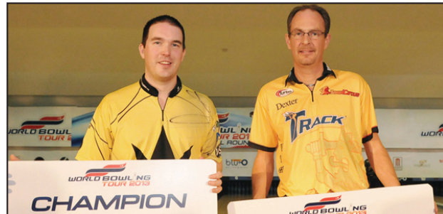
Sean Rash & Mika Koivuniemi