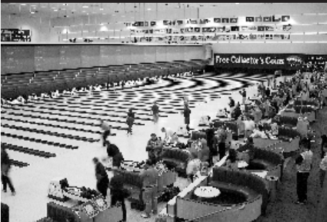
Bowling at the NBS