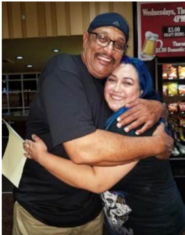
“Showing good sportsmanship with a friendly hug after fierce competition.”