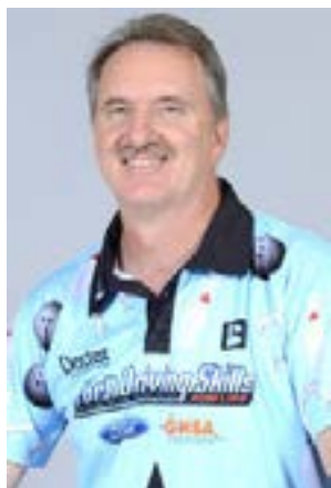
Walter Ray Williams Jr.