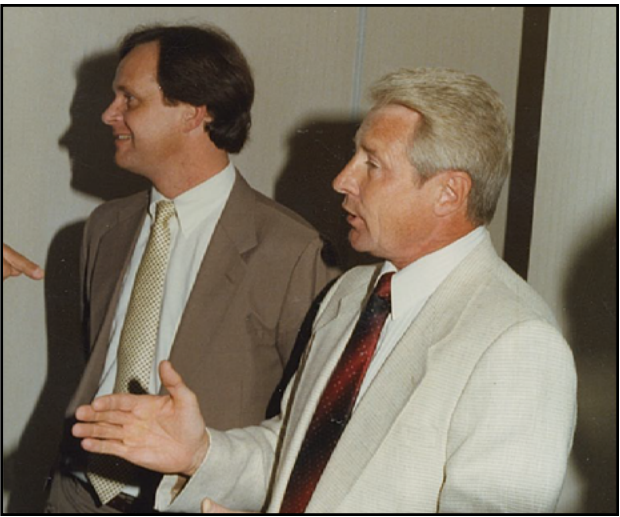
Bowling in the Olympics?

Now freedom is being taken away from the citizens of Hong Kong, almost 30 years before the agreement between the United Kingdom and China is to expire. "Freedom, not extradition to China," is what started the Hong Kong protests. In the United States we take this freedom for granted, because no one has ever attempted to take it from us on such a grand scale. Freedom is not free, or so the United States axiom goes. The Hong Kong citizens, perhaps more than any element in society today, are losing their liberty and fighting back. The protests are an interesting study in the power that has been bestowed in each of us to fight for our freedom. Benjamin Franklin said it best when he opined, "Those who give up liberty for safety deserve neither."