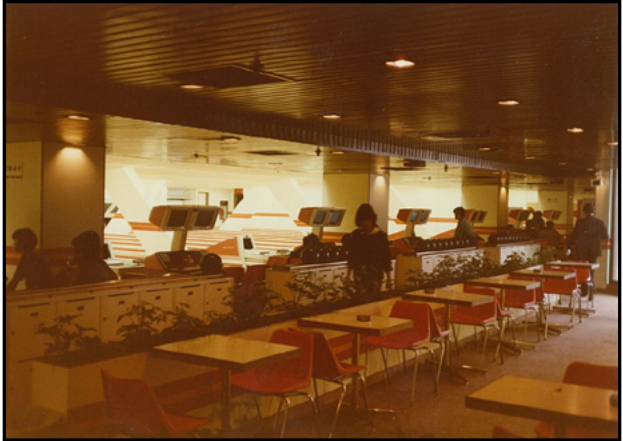
Tuen Mun Grand Opening