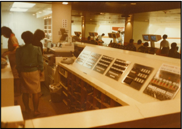
AMF Showplace in Asia

It's ironic to me that just a little over 30 years later, the "protestors" in the streets are now pro-democracy residents, carrying the United States flag and quoting passages from the Declaration of Independence, as they are being rounded up by the police. In one recent weekend rally of more than 2,000,000 citizens, their theme song became "Sing Hallelujah to the Lord," even though only 10% of the population profess to being Christian. As I looked further through the Hong Kong folder from my Mini Storage Warehouse Museum, another memo listed a total of 17 bowling centers in the city and surrounding territories.