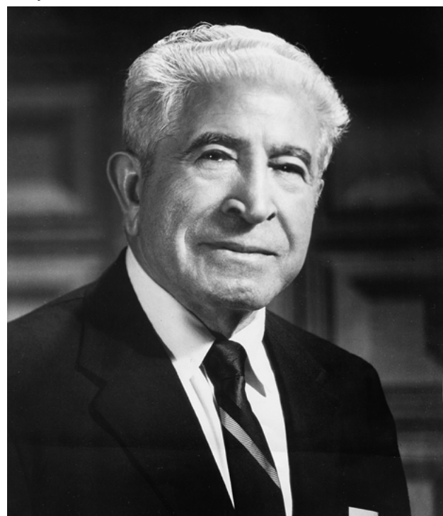
Andy Varipapa was one of the leading performers when TV bowling was extremely popular in the 1950s and ’60s.

But bowling on TV is making a comeback. Per- continued on page 3