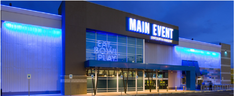
(Special thanks to Main Event Entertainment for providing photos of two of their new locations)