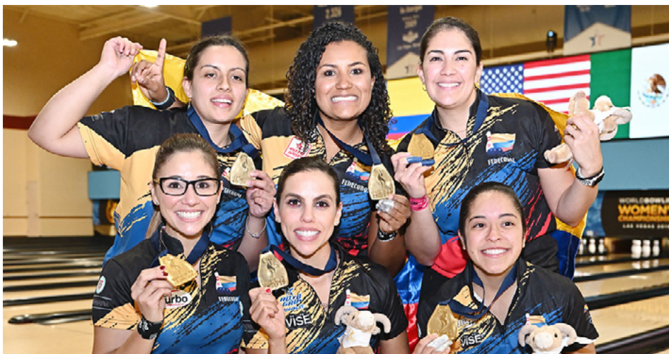
Deserving second gold medal for Team Colombia

But Sweden bounced back with a 235-220 victory in the second match to force a sudden decider. The Swedes started off well in the third match with a