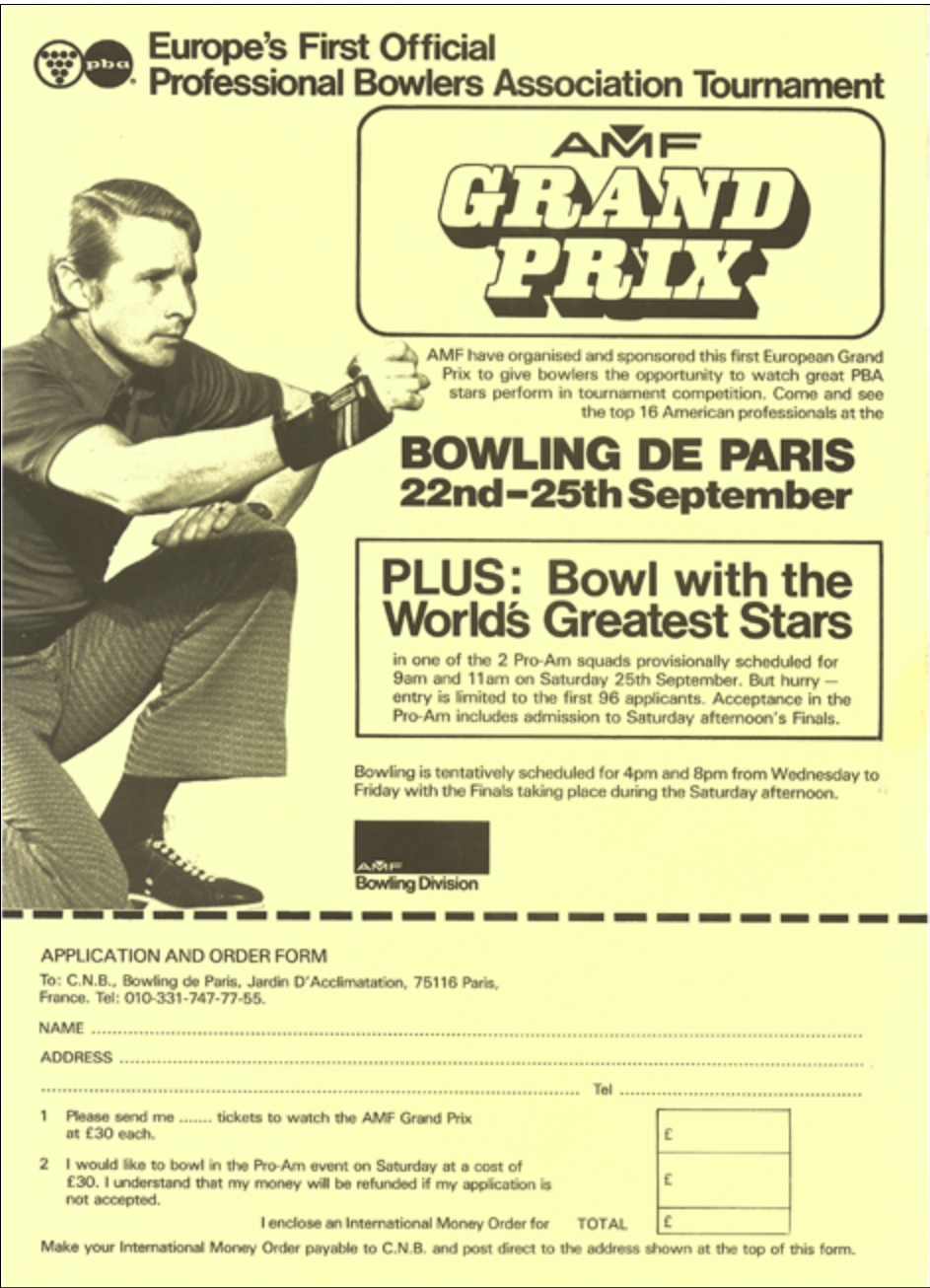
Entry Form for the 1982 AMF Grand Prix in Paris!