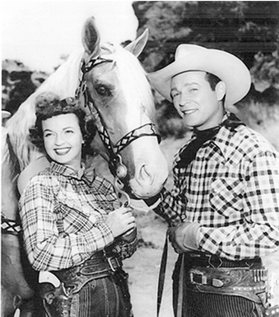
(left to right) Dale Evans, Trigger the Wonder Horse, and Roy Rogers at th Chatsworth Ranch (1952).