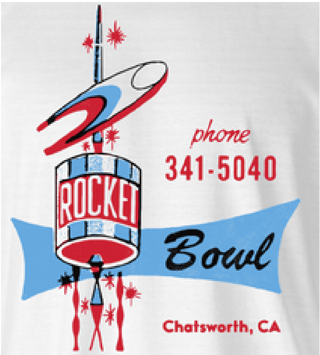
AMF Rocket Bowl t-shirt design provided by m00nshot.com

I have so many memories of AMF Rocket Bowl, where I was stationed for a few years while driving up and down the left coast of the United States promoting bowling along the Interstate 5 corridor of California, Oregon and Washington. It was an exciting time with so many bowling centers in the San Fernando