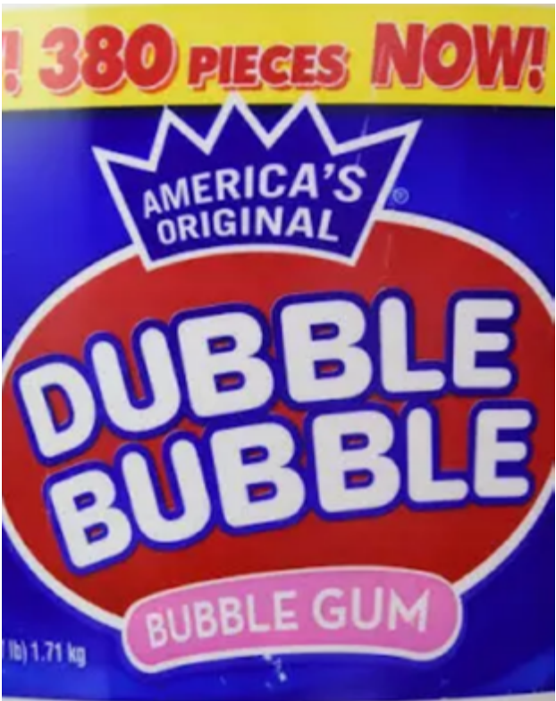
“Double Bubble” chewing gum - The favorite of bowlers worldwide

Medical experts agree that swallowing gum will likely have minimal to no impact on the health of most people. However swallowing gum can be dangerous for some people.