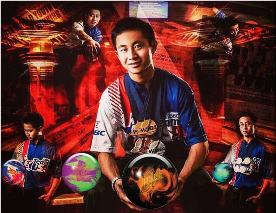
“It’s an honor just to be able to say you represent your country”