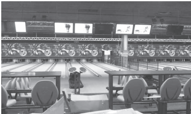
Come try out the ABTA at Chaparral Lanes in Chino Hills

Due to a Very Popular Cosmic Program at this Center we are having a Beat the Board