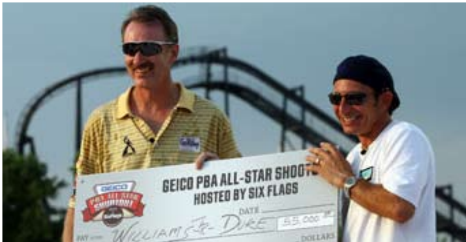
Walter Ray Williams Jr. and Norm Duke won the GEICO PBA All-Star Shootout Hosted by Six Flags.