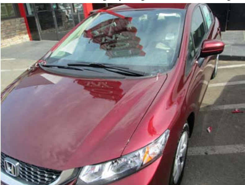
This 2015 Honda Civic, parked outside Winnetka Bowl, awaits the winner of the stepladder finals.

He needed 12 strikes for the magical perfect game score of 300. But the right-hander’s 11th shot left the 10 pin. “It wasn’t my best shot, but it should have carried [for a strike],” he said.