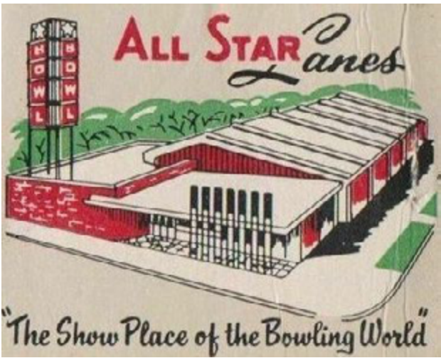
All Star Lanes in the Chicago suburb of Skokie was my home base while living in the midwest. The bowling center was once featured in Life Magazine. Today, it has been replaced by a strip mall.