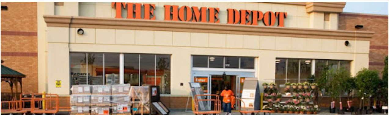
Even AMF's former World Headquarters along the Long Island Expressway (I-495) was demolished and replaced with - what else, a Home Depot.