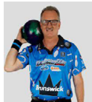
Walter Ray Williams Jr.