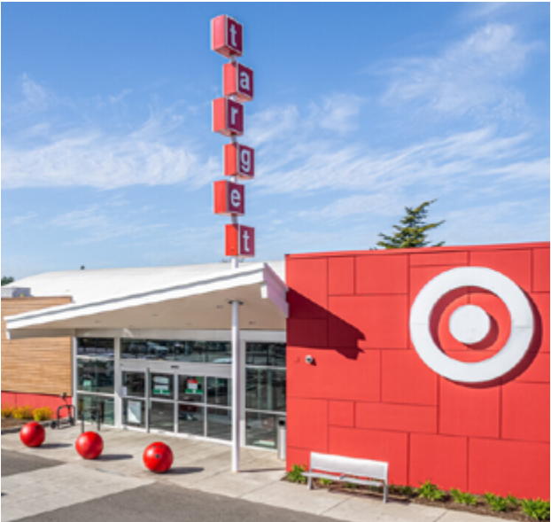
In 2021, I wrote an article about Pro 300 Lanes ("Target Stores Takes Unique Approach in Memorializing Bowling Center"), one of 26 bowling centers in Portland while I was a resident. Today, only 2 remain.