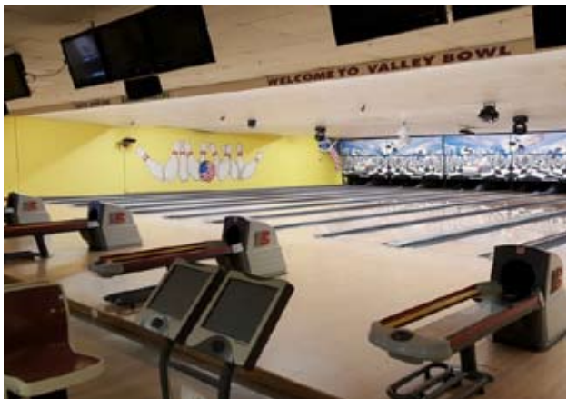
Valley Bowl in Madera closed five weeks ago because of structural damage to its roof.

7502 Florence Ave, Downey, CA 90240 • Online: www.californiabowlingnews.com • Email: news@californiabowlingnews.com • Office: (562) 807-3600 Fax: (562) 807-2288