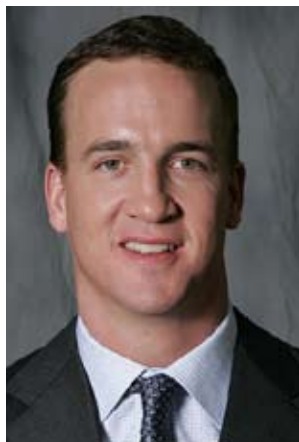
Peyton Manning Keynote Speaker at Bowl Expo

Featured this year is two-time Super Bowl Champion, Peyton Manning, as the Keynote. Manning is scheduled to speak on June 29th about his insights surrounding the importance of teamwork/