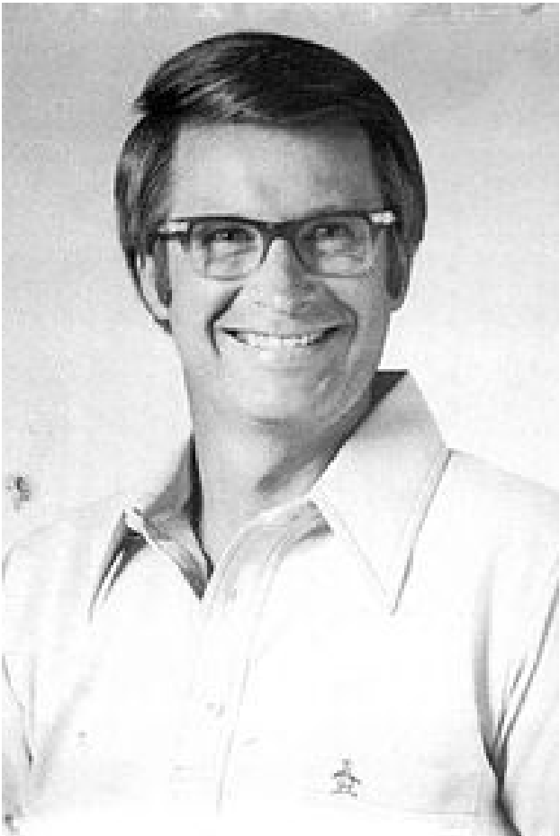
Earl Anthony, 1979

(Portions of this article and the photo were adapted with permission from the October 1976 issue of Bowlers Journal)