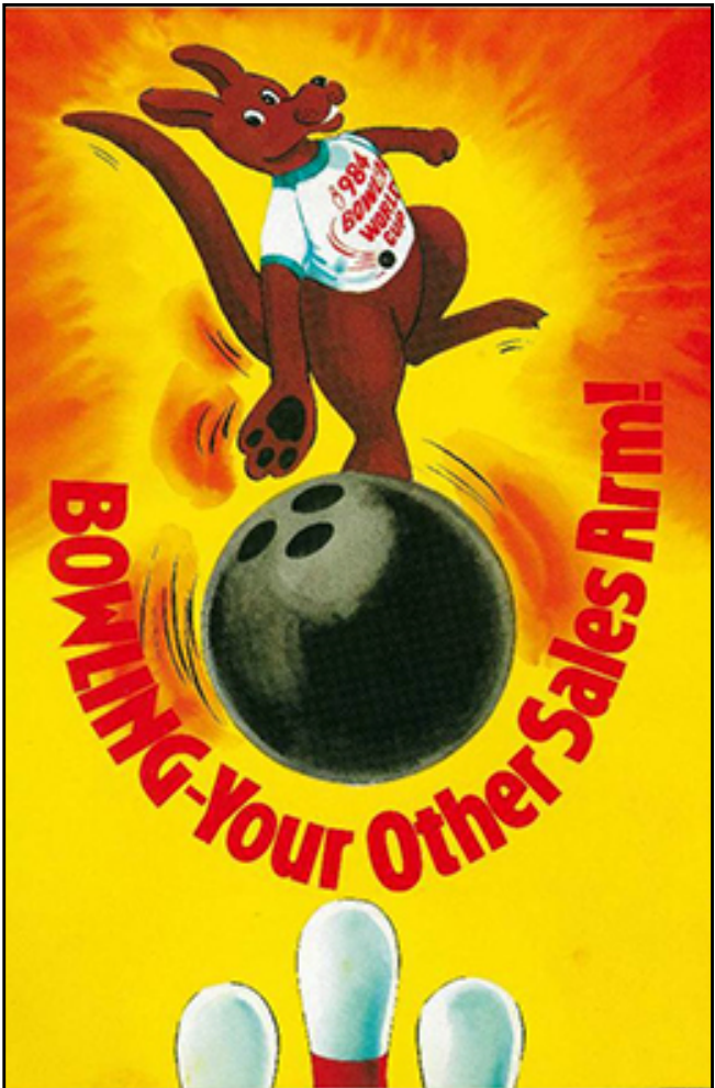
Bowling World Cup Brochure (1984)