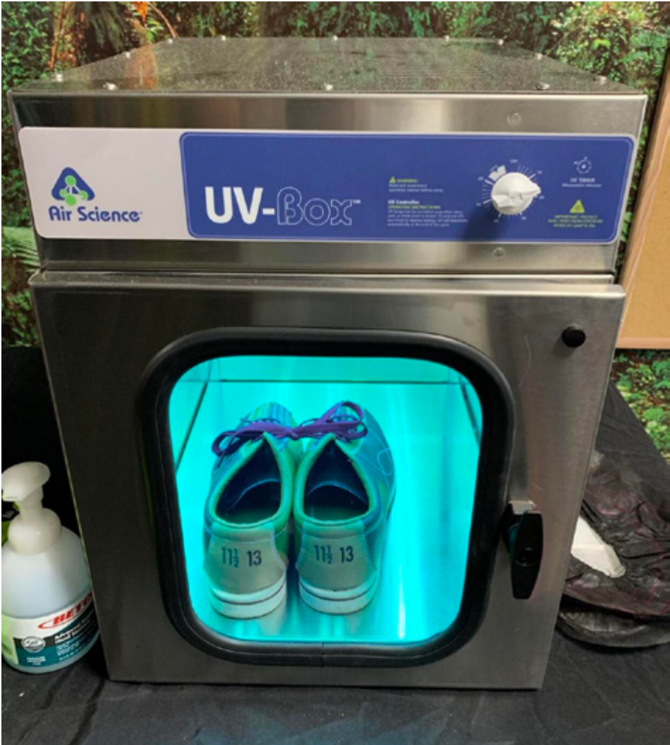
UV-Box from 2020