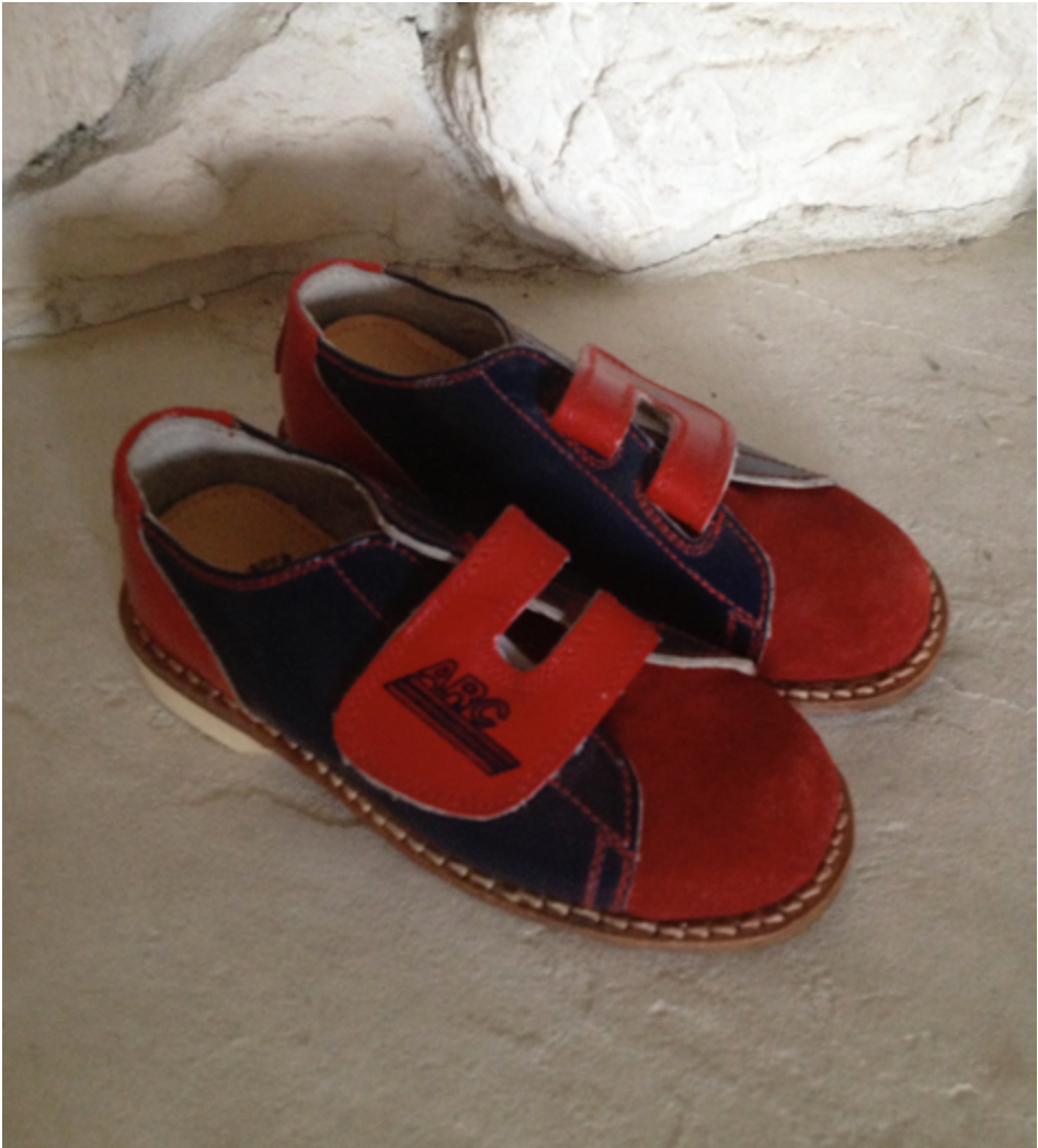
ARC’s Special Shoes from 1989

The vision in ARC’s Marketing Plan from that day forward was as follows: “Provide a top quality shoe at all times and charge for it.” Within a year every ARC location had bought into the program and our revenue for shoe rental doubled. When asked how to determine whether or not to discard an old pair of rentals,