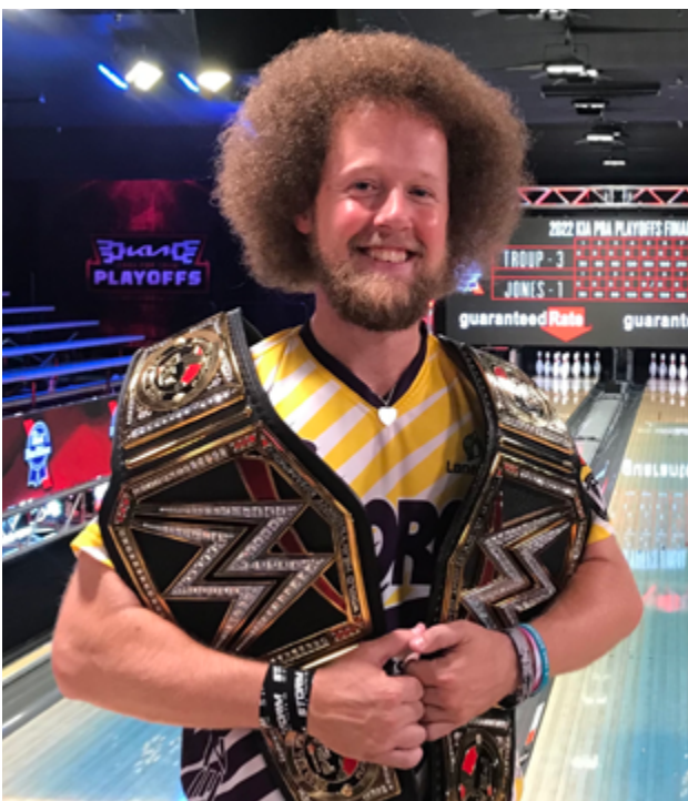
2022 PBA Playoffs Champion Kyle Troup