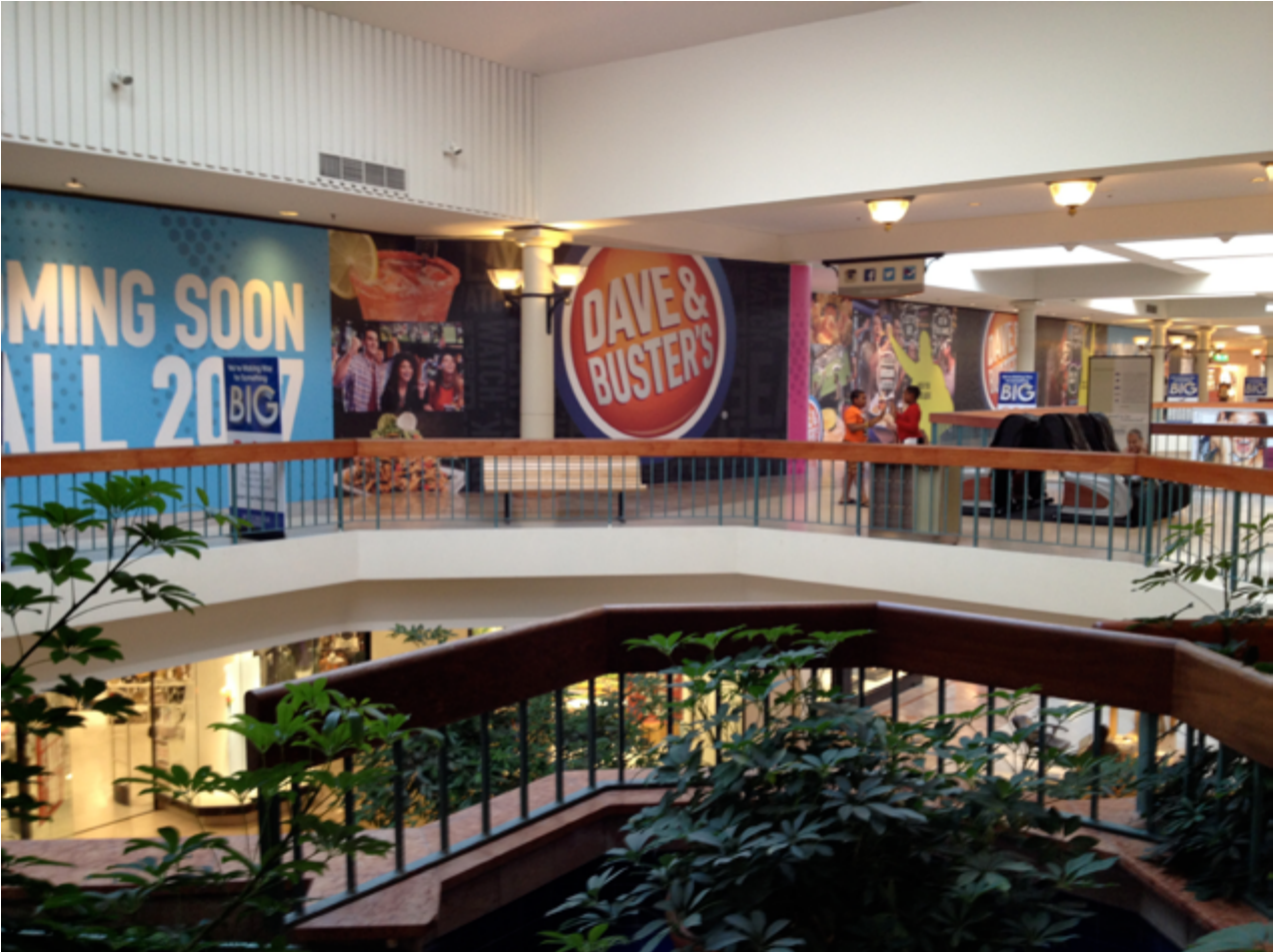
Dave & Buster's opened a "BIG" location in 2017 at the Woodbridge Mall in New Jersey, but with no bowling lanes... yet!