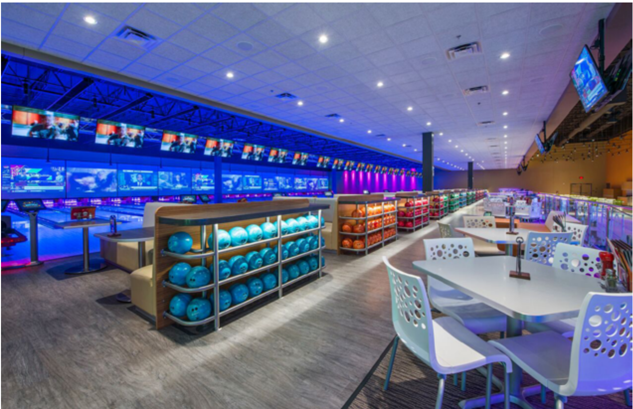
This is one of many pictures that Main Event provided for an article written in June of 2018, showing the attention to detail of their interior designs.