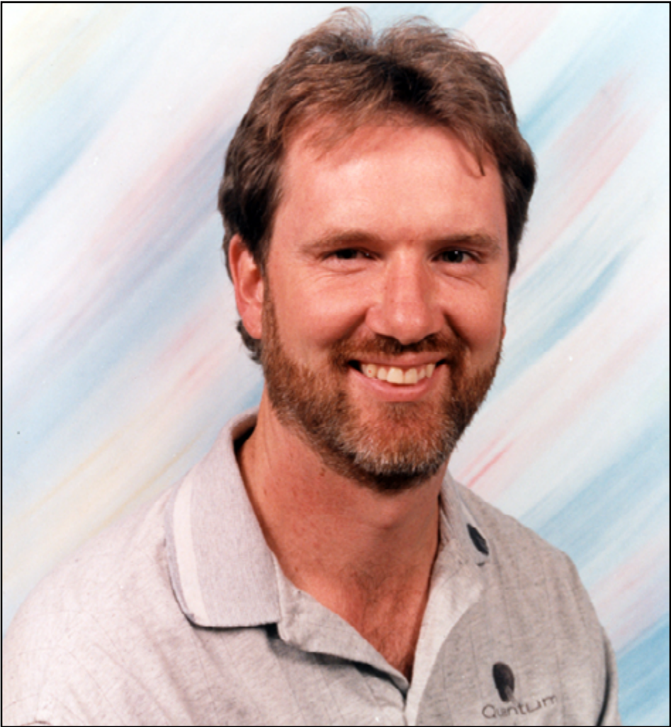
Walter Ray Williams Jr.