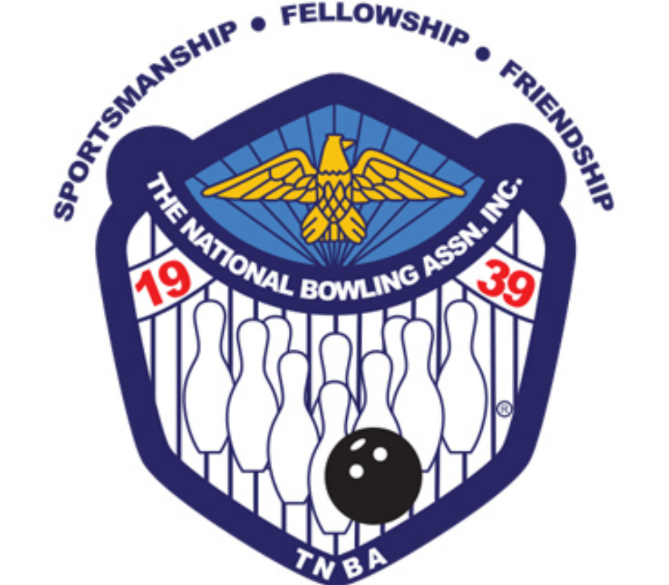
TNBA Motto -- Unlike the "white only" clause that existed in the ABC until 1950, TNBA has maintained a focus of inclusion to all bowlers since 1939.