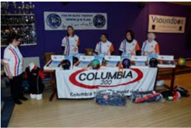
A number of volunteers during the YET Tournament at Chandra Bowling Nieuwegein (Holland) behind the stand of one of the sponsors Columbia 300