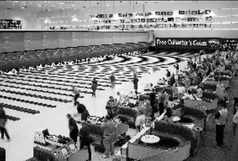
Bowling at the NBS