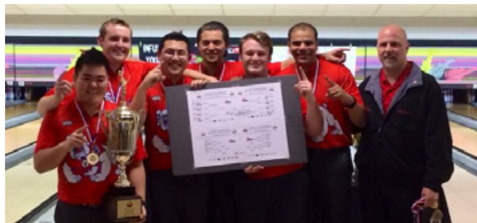
2015 Intercollegiate Club Championships where the Bulldogs were crowned National Club Champions!