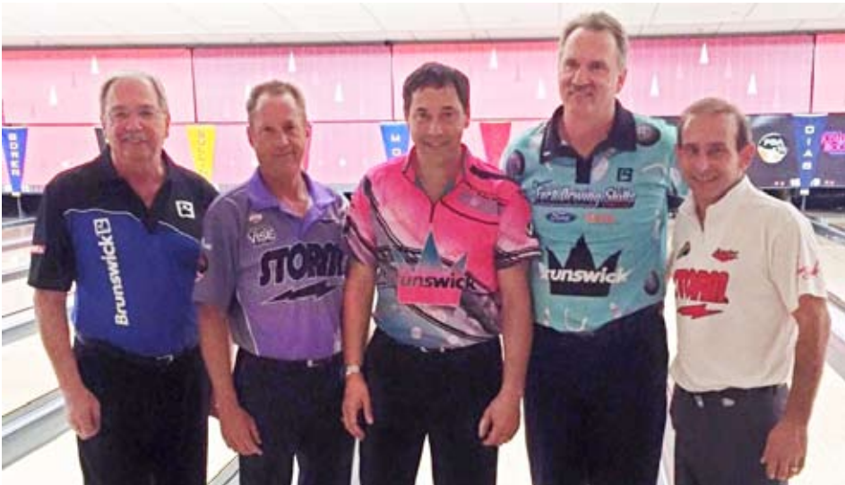
Johnny Petraglia, Pete Weber, Parker Bohn III, Walter Ray Williams Jr. & Norm Duke

“It feels good to be back in the winner's circle,” said Williams, whose last