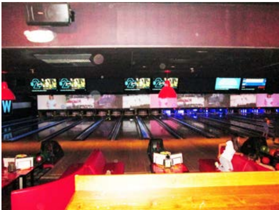
Bowlmor bowling centers have attracted big crowds at night from their party and dating groups but they lack strong support from league bowlers. This Bowlmor site in Woodland Hills has often been visited by the famed Kardashians.