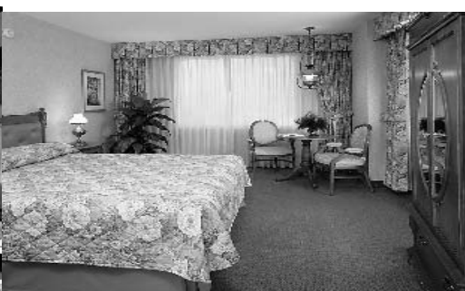
Luxury Hotel Rooms