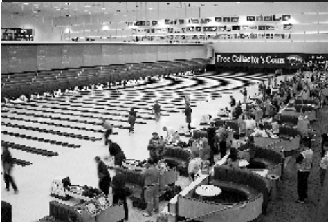
Bowling at the NBS