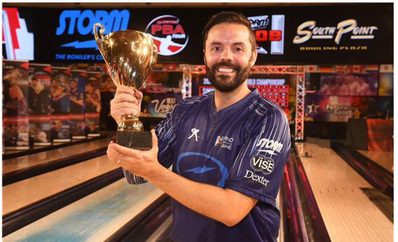
Jason Belmonte