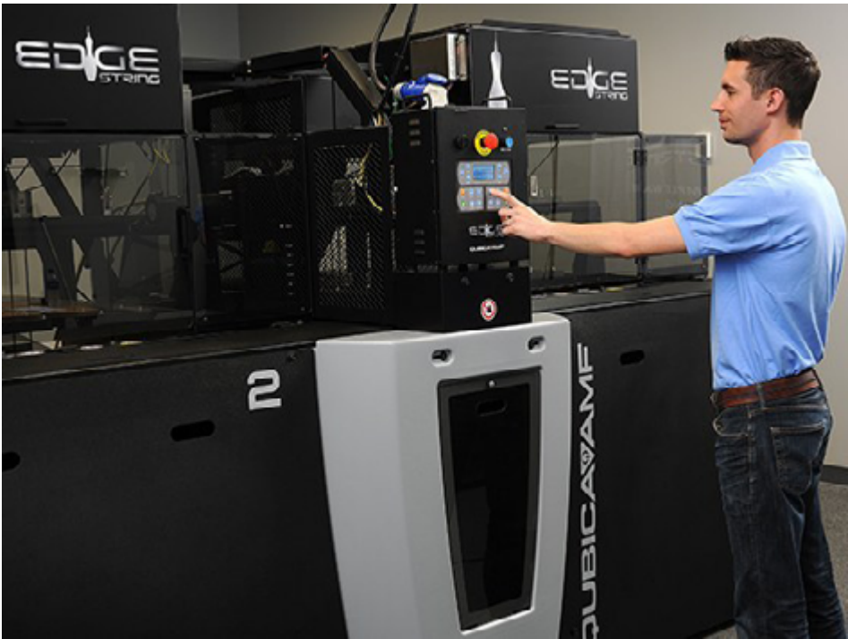
The EDGE String Machine