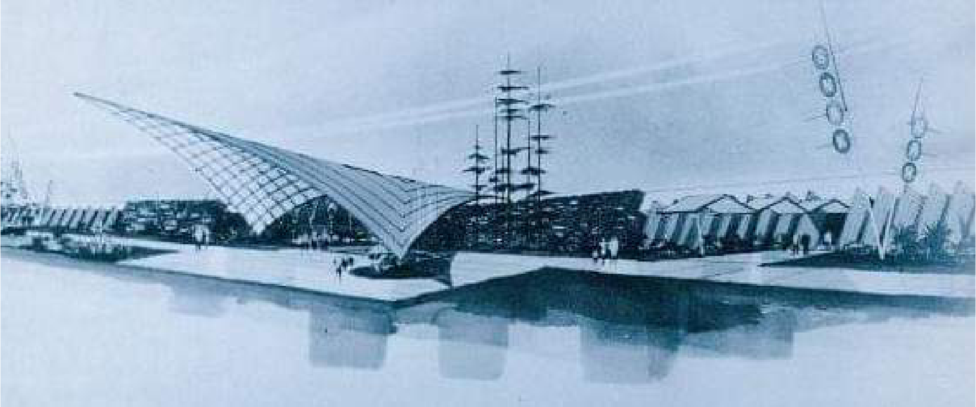
This artist’s rendition from Powers, Daily and DeRosa highlights the “googie architecture” featuring a massive parabola at the entrance.

Portions of the above article appeared in Bowlers Journal International and are reprinted with permission.