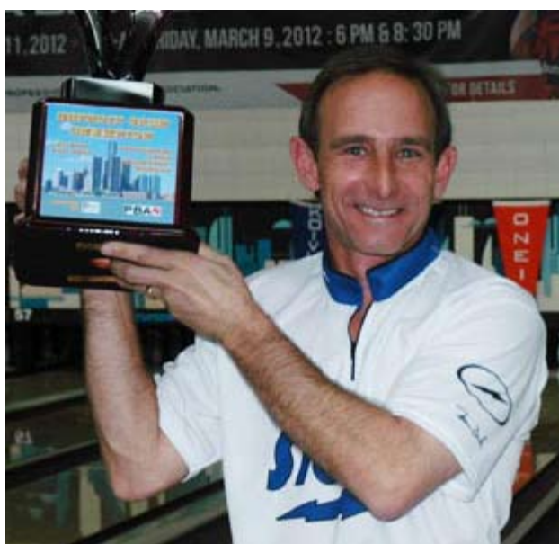
Norm Duke Celebrates His 35th Career Title

ALLEN PARK, Mich. (March 11, 2012) – Professional Bowlers Association Hall of Famer Norm Duke won the PBA Detroit Open presented by Track Sunday for his first win of the 2011-12 season and the 35th of his career.