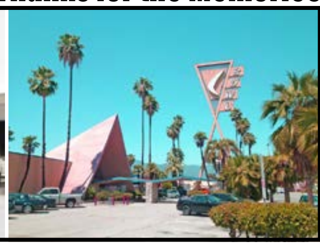
COVINA — Covina Bowl will be closing their doors on March 12, 2017. Built in the late 50's, it has been more than just a place to bowl. The coffee shop! Locals enjoyed the great food and friendly atmosphere. Civic clubs made good use of the many meetng rooms. The San Gabriel Valley ABC and WIBC offices were centrally located at Covina.

Ask any patron and each remembers a special time or event. How about the pool tournaments? The Pro Shop? Terrazzo floors were installed in many centers in the early years. Covina bowlers loved those floors and protested when a rumor spread that the floors were to be replaced a few years ago. We all will remember good times, and good friends at Covina Bowl.