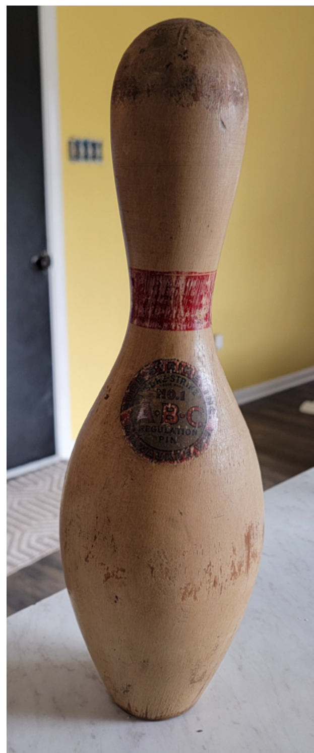
Antique Bowling Pin

• Antique Bowling Pin photo provided by the Bowling Museum & Hall of Fame