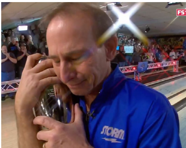
Go Bowling! PBA Indianapolis Open Champ Norm Duke