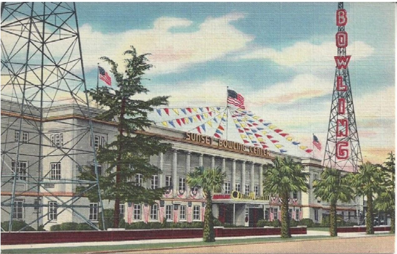
Sunset Bowling Center Grand Opening