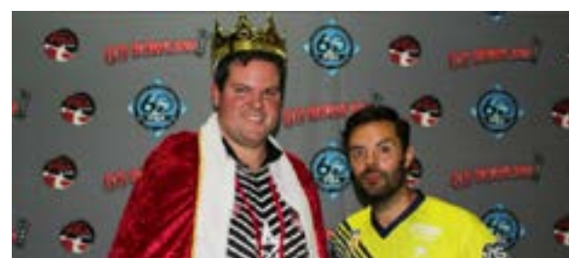
Wes Malott & Jason Belmonte

game, 250-213, Malott came through with a clutch 10th-frame performance in the second game throwing three consecutive strikes to beat Belmonte 227-225. Belmonte, who finished the game first, threw the first two strikes in the 10th but left the 2-8 on his final ball