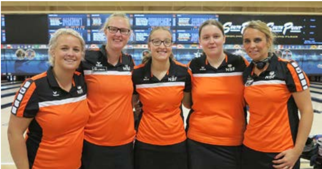
Dutch Ladies Team World Championships 2017 Las Vegas