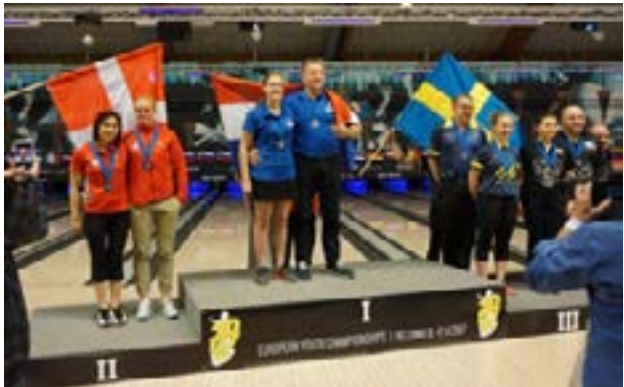
GOLD MASTERS EUROPEAN YOUTH CHAMPIONSHIPS 2017 HELSINKI