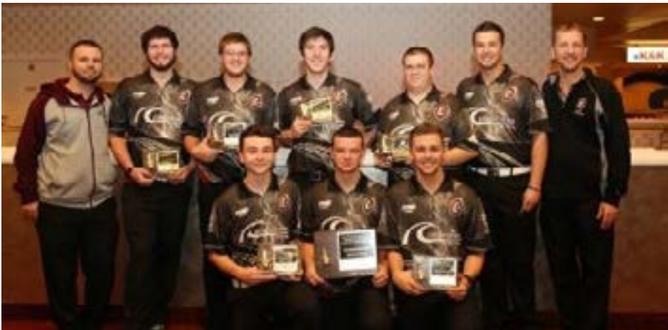
Calumet of Saint Joseph