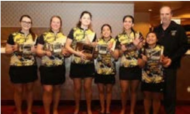
Wichita State University

Congrats to all these awesome youth bowlers.