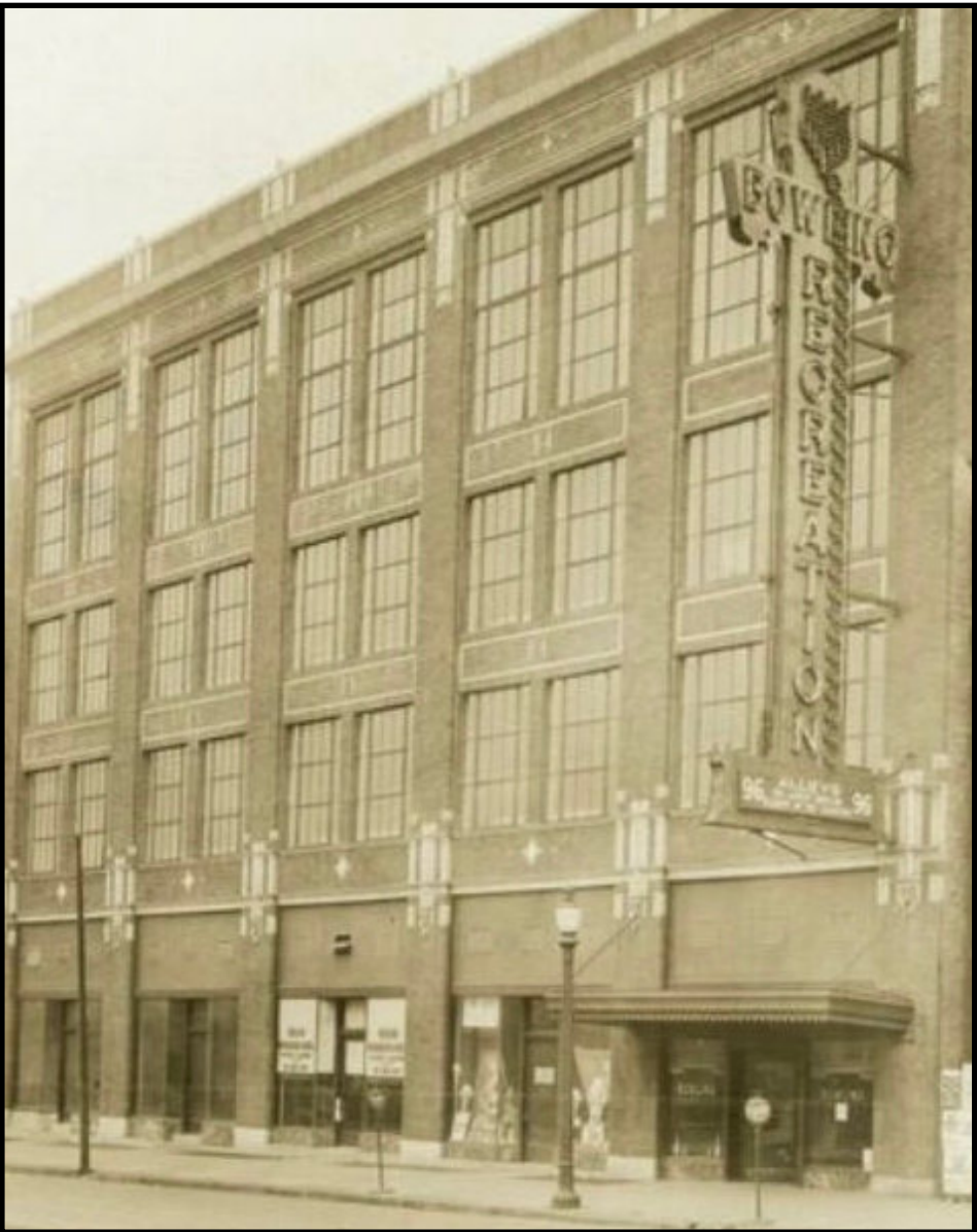
Recreation Bowling Alley during its heyday (circa 1925).

begin the process of opening several other duckpin and tenpin bowling centers in and around Baltimore.”