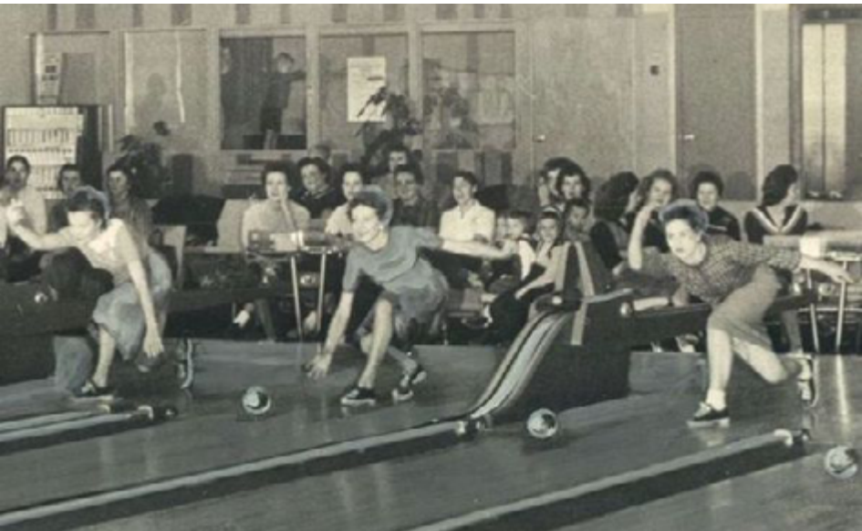
This photo from the Baltimore Sun in 1959 shows patrons enjoying the game of duckpins (note the small bowling balls)

Wally reports that the operation was highly successful with duckpin leagues double shifted every evening. “After World War II had ended, the top floor was converted to a ballroom for public dances, and the removed lanes were used to