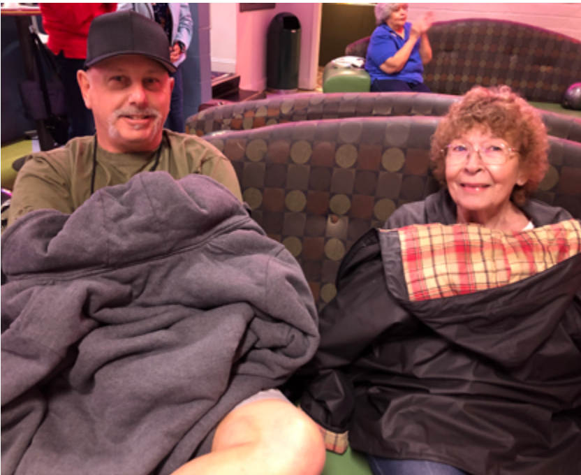
“Snowbirds” bundle up between frames as cold and wet weather hits SoCAL & Empire Bowl.