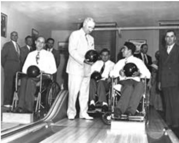
President Truman at Inaugural BVL Tournament