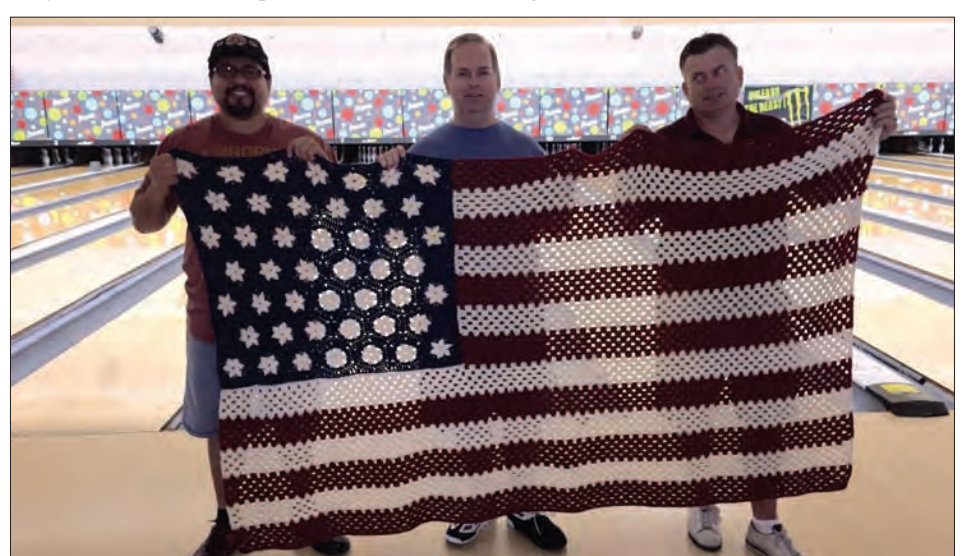
Military Veterans displayed the American flag during opening ceremonies at Bowlium Lanes.

REVOLUTIONS BARSTOW BOWL 750 E. Main Street, Barstow CA 92311 760-256-8676 www.barstowbowl.com