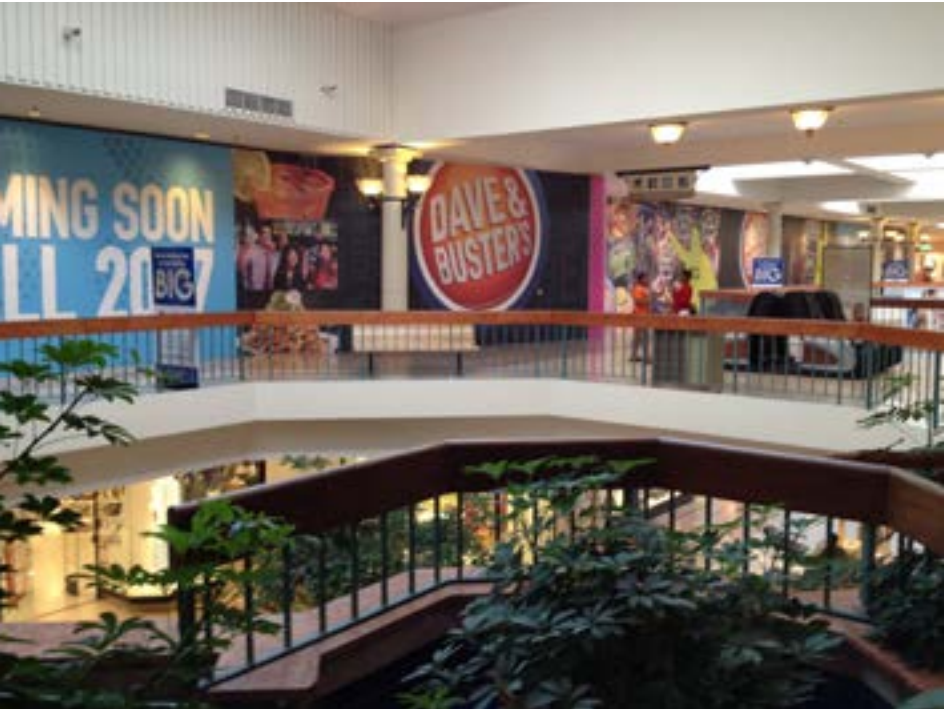
Shopping Malls across the USA are embracing chains with bowling lanes, like Dave & Busters, as an alternative to empty storefronts.

Applying that same philosophy to marketing in 2017, it could be said that bowling on the sixth floor of a building, or in a basement, is entirely feasible. And besides, what else are we going to do with all that free time we have from not watching football?!