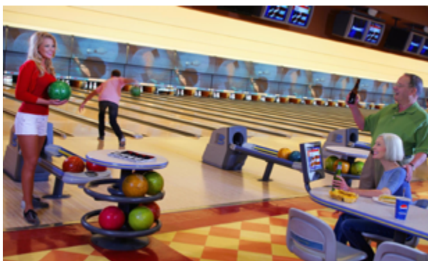
Public Bowling at South Point Bowling Center (64 lanes)