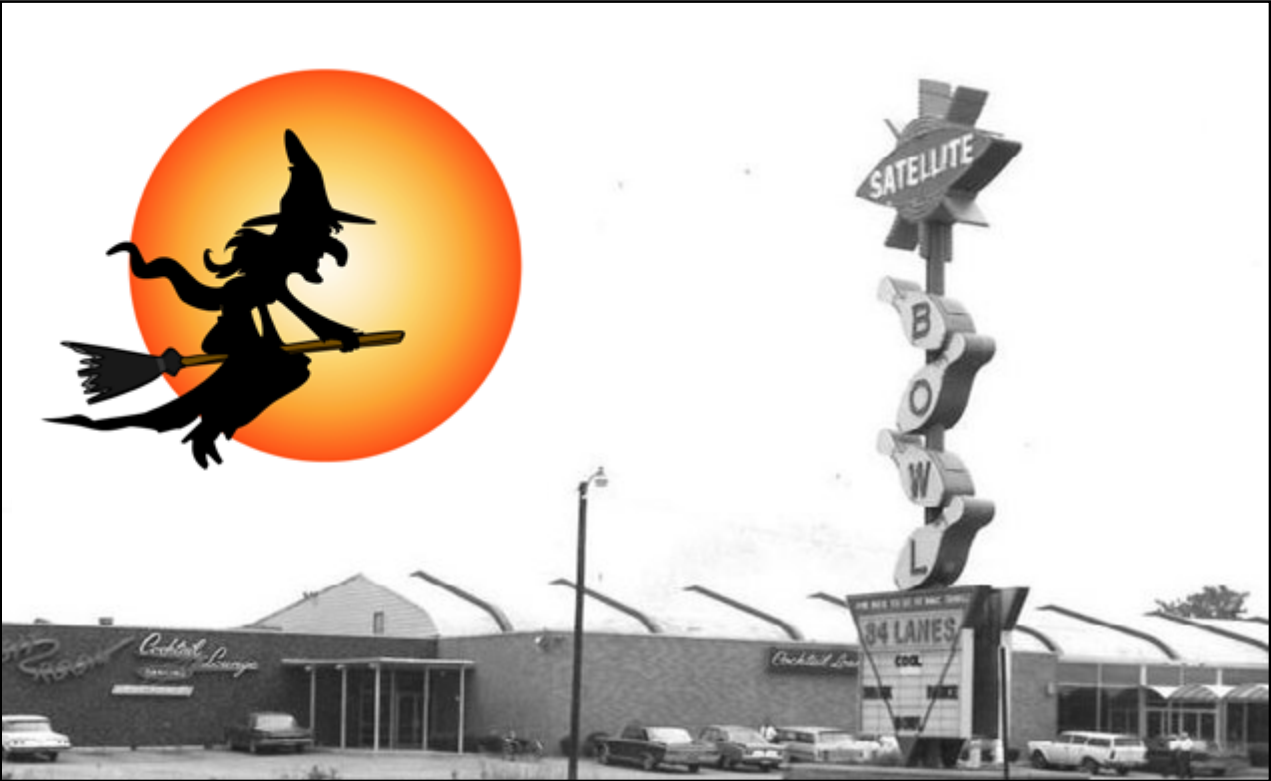
Satellite Bowl

Another bowling center, Detroit Recreation, popped up in my quest for further information about Satellite Bowl. It had a total of 22 lanes on four separate floors in downtown Detroit, making a grand total of 88 lanes. Detroit Recreation closed in 1960. If you have any further information about Detroit Recreation, or are aware of any large bowling centers (80 or more lanes) in your area that have closed, let us know and we will add them to the list.