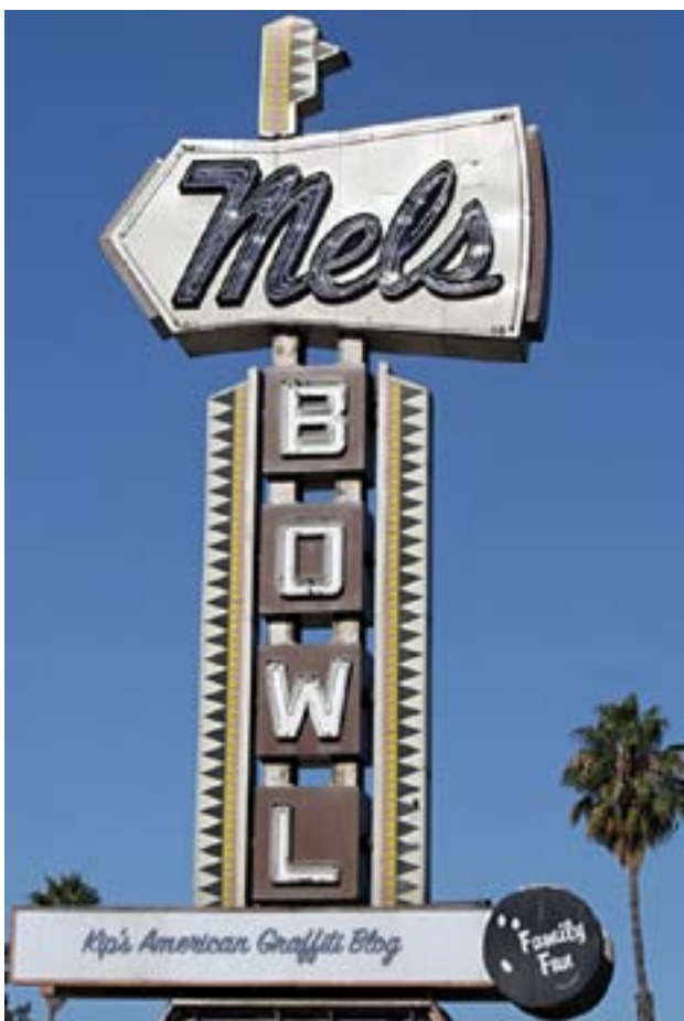
Although Mels Bowl in Redwood City had no architectural significance, the sign out front was spared because of its "googie art" importance.