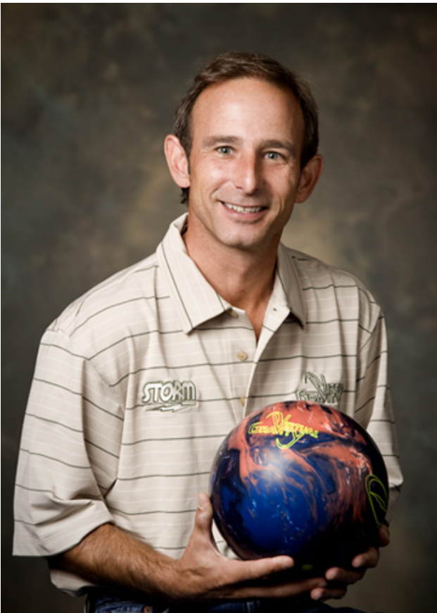
Norm Duke King of Swing Champion